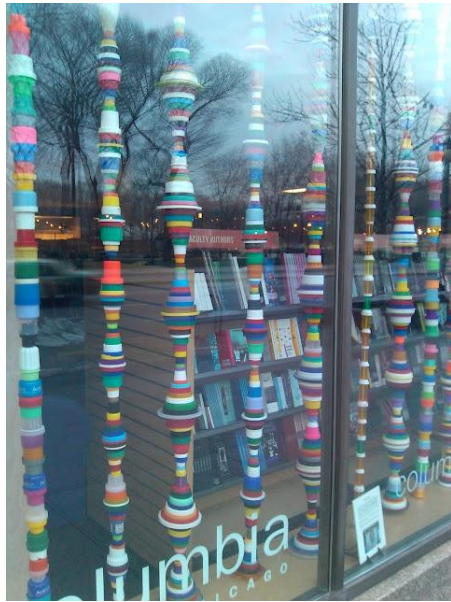
Recycled plastic lids